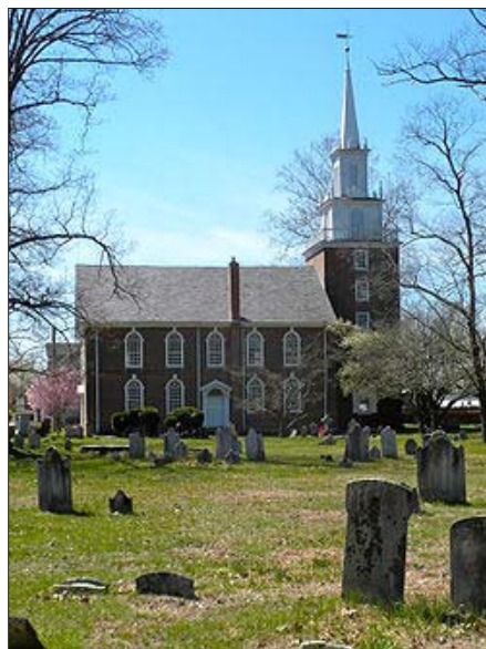
Old Swede's Church, Swedesboro, New Jersey.

Today we picked up our rental car. Even though it had a GPS, it did not take many minutes before we were lost. After a few days we understood the American system of signs and