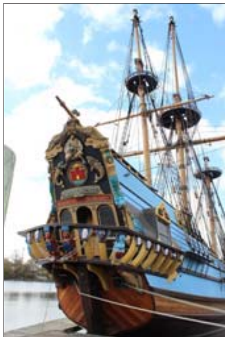
The Kalmar Nyckel replica.