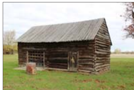
The Swedish Granary.

We started by going to the "Swedish Granary" in Greenwich, by the Maurice River, at the southernmost point of New Jersey. We had seen pictures of that house and now we hoped to find that it had been built in the Nordic manner. At a distance it looked so, but this building was also built without the sealed log walls.