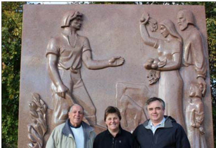
The Finnish Settlers Monument, by Väinö Aaltonen, first inaugurated at the 300 th jubilee in 1938. It is located in Chester, Pennsylvania.

The next stop was the open air museum "New Sweden Colonial Farmstead" in Bridgeton City Park (NJ), which was built for the 350 th anniversary celebration of New Swe-