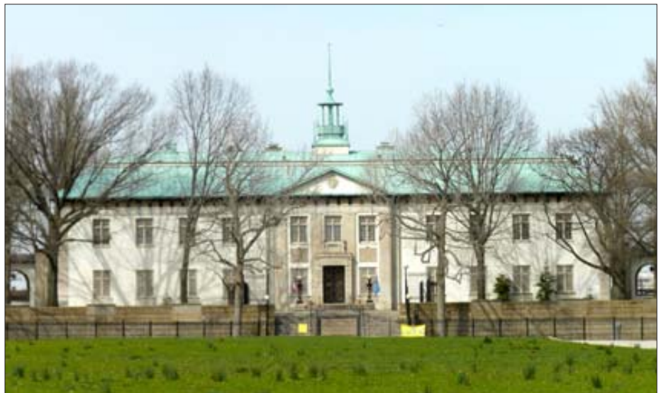
The American Swedish Historical Museum in Philadelphia, Pennsylvania.

This was another day with an early start. We went back to the museum